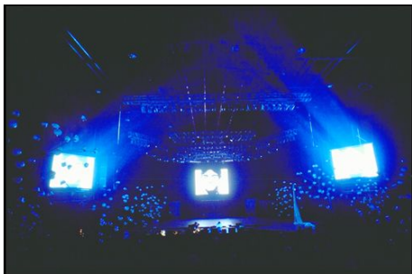
Undercurrents, Taipei International Arts Festival, April 2001

Toy Satellite is a not-for-profit media culture organisation, extending opportunities for new media arts practice for civil society throughout the Asia and Pacific region.